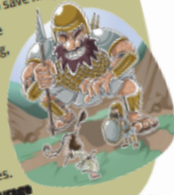
Illustration based on a Spanish 15th-century painting.

The giant laughed scornfully at the small boy and shouted curses at him. David did not flinch. "This very day you will be defeated and everyone here will see that the Lord does not need swords or spears to save his people." As Goliath lowered his shield and aimed his spear at the boy, quick as a flash, David loaded a stone into his sling, spun it around above his head and sent it spinning through the air towards Goliath. The stone struck the giant on his forehead and he crumpled to the ground. Goliath was dead. There was a moment of stunned silence before the whoops and cheers from the Israelite army echoed around the hillsides. This was a day no-one would forget, when the courage of a shepherd boy saved a nation.